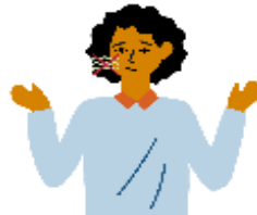
Loss of Taste or Smell