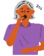
Fatigue *New or Unexplained