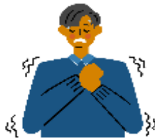
Fever or Chills

Have you experienced these symptoms within the last three days?