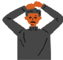
Headache *New or Unexplained