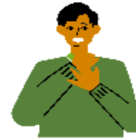
Shortness of Breath or Difficulty Breathing