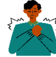
Muscle or Body Aches *New or Unexplained