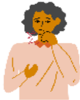
Sore Throat *New or Unexplained