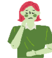
Nausea, Diarrhea, or Vomiting *New or Unexplained

DO NOT ENTER IF YOU HAVE ANY OF THE ABOVE SYMPTOMS